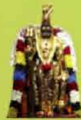
Sri Darma Muneeswaran Temple