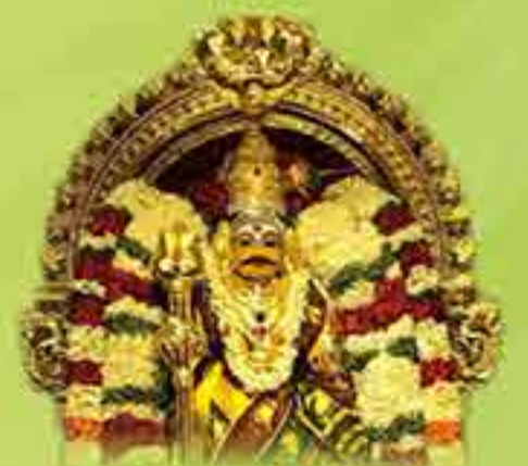
Dama Muneeswaran Temple

Refulgence is not just a software solutions company. It's a 'Total IT Solutions' spot. What more? Place your order and leave it to us. We will provide the complete Hardware, Networking, Software and all accessories to you with support.