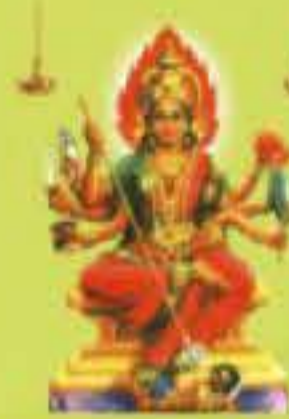
Sri Veeramakaliamman Temple