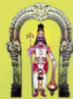
Sri Muneeswaran Temple