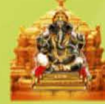
Sri Senpaga Vinayagar Temple