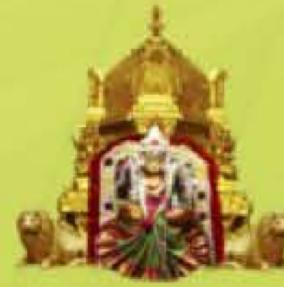
Sree Maha Mariamman Temple