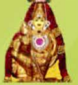
Holy Tree Sri Balasubramaniyar Temple