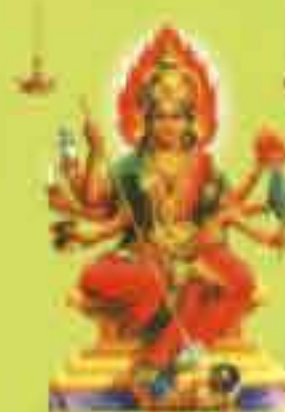
Sri Veeramakaliamman Temple