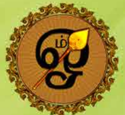
Sri Murugan Hill Temple