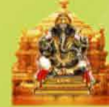
Sri Senpaga Vinayagar Temple