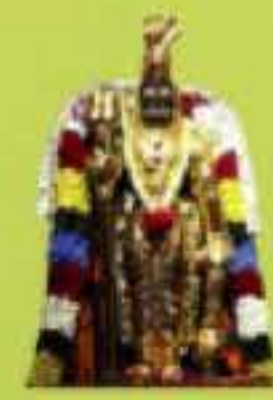
Sri Darma Muneeswaran Temple