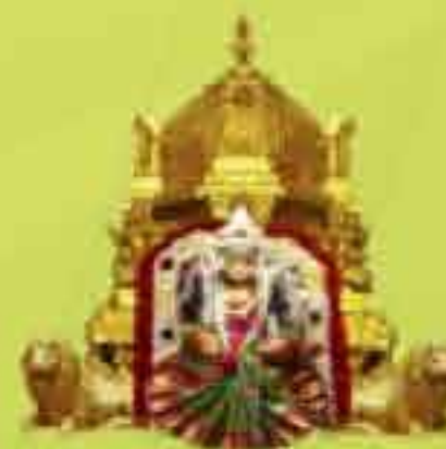
Sree Maha Mariamman Temple