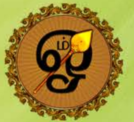
Sri Murugan Hill Temple