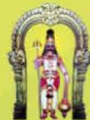
Sri Muneeswaran Temple