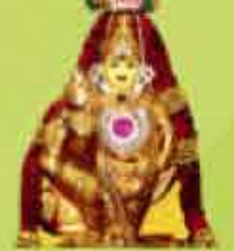
Holy Tree Sri Balasubramaniyar Temple